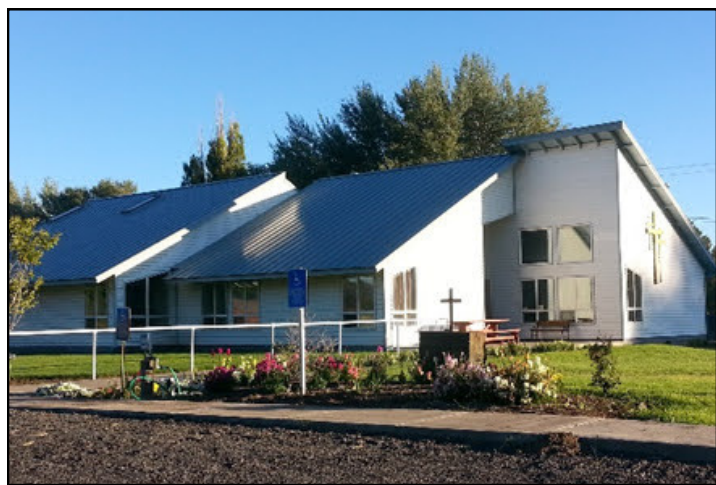
Prineville Presbyterian Church