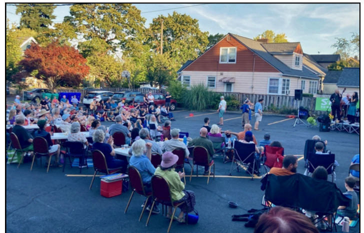
Neighborhood concerts in the Moreland PC parking lot

Over the past few years, Moreland has evolved into a community center for the arts. They are the anchor location in SE Portland for the educational programs of the Oregon Repertory Singers for students K-12. Every Wednesday during the academic year, approximately 150 students find their way to Moreland to participate and fill the whole church property with glorious singing. Moreland also serves as a performance venue for Classical Up Close, a non-profit created by musicians from the Oregon Symphony who offer free community-based chamber music performances each spring. For the past three years, they have hosted the last of their performances for their season, and they are due to host that final performance this next season.